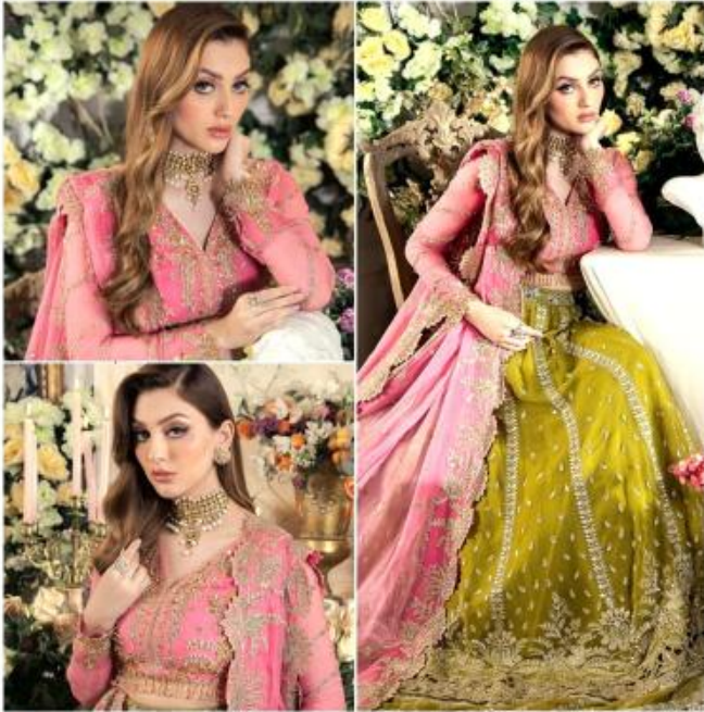
TOP- CHOLI AND LEHNGA PURE FOX GEORGETTE WITH HEAVY EMBROIDERY AND SEQUENCE WORK WITH HEAVY FLAIRS BOTTOM-INNER- DULL SHANTOON DUPATTA- PURE FOX GEORGETTE FANCY DUPATTA AND HEAVY EMBROIDERY