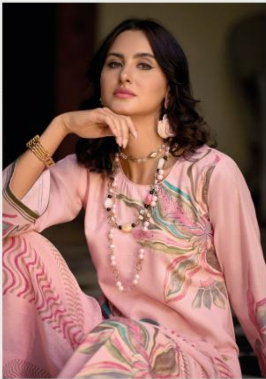
ROSHINA | 1034

PURE ELEGANCE WITH ALPHABETIC FLORAL PATTERNS IN LACY FABRIC AND BLENDED TO YOUR STYLE