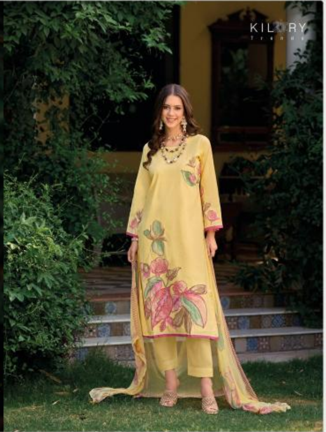
PURE ELEGANCE WITH ALLURING FLORAL PATTERNS ON LACY FABRIC AND ADD GLAMOUR TO YOUR STYLE