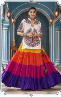
RASS - 2441