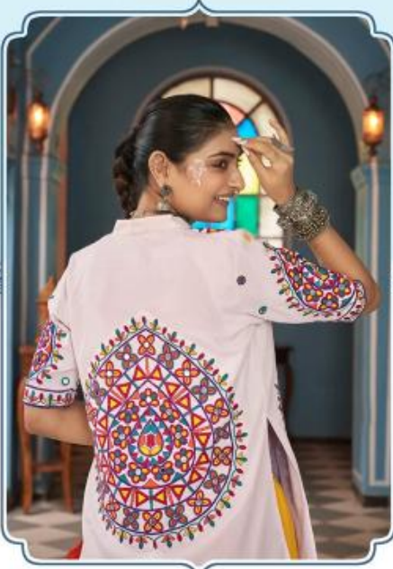
RASS - 2441