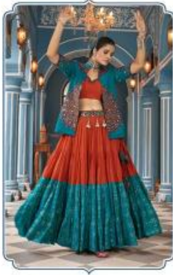
RASS - 2442