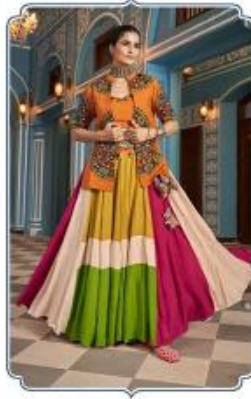
RASS - 2444