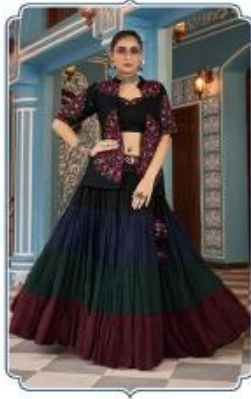
RASS - 2443