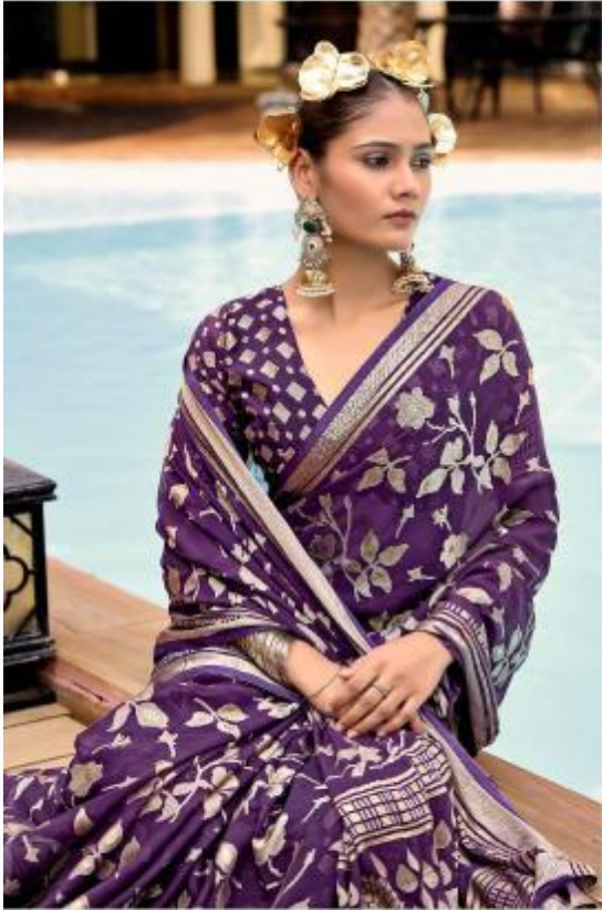
Chennai Heritage, adorned with elegance. The saree is my canvas.