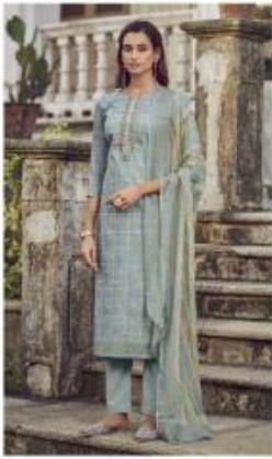
D No / 39003