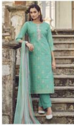
D No / 39004