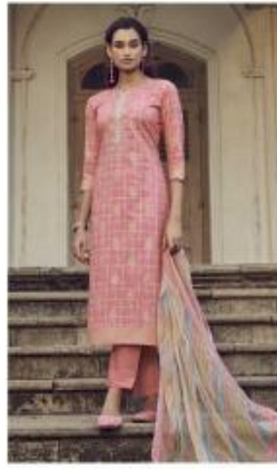
D No / 39002