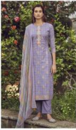
D No / 39001