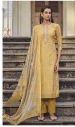
D No / 39005