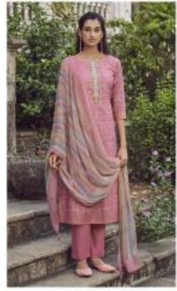
D No / 39006