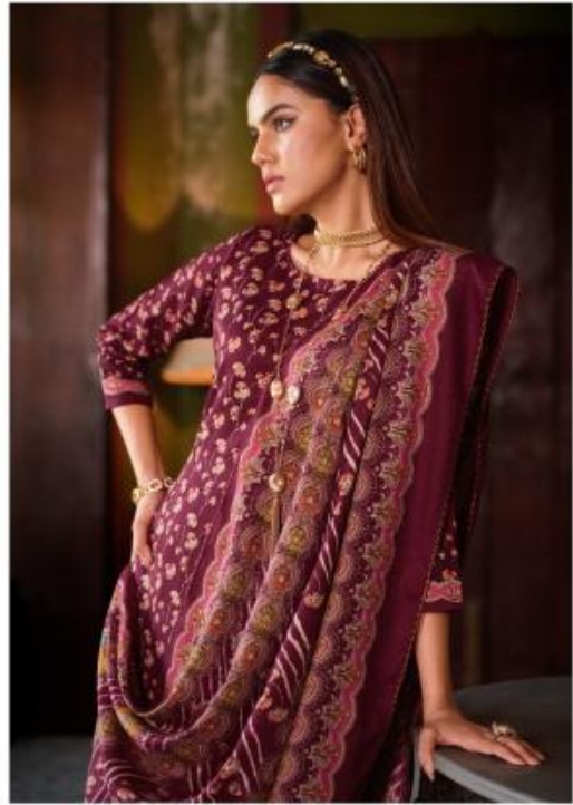
THE MAGNUM OPUS | 522-006

THE MAGNUM OPUS HAS BEEN SELECTED TO BE THE COVER PAGE OF L'ESPEYRE FASHION MAGAZINE THROUGH THE WORLD CUP FASHION SHOWS THAT WILL BE HELD IN THE WORLD'S TOP CITIES.