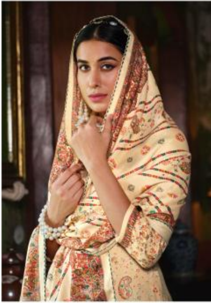
THE WORLDCHARMER | 522-001

ALL RIGHTS RESERVED. NO PART OF THIS PUBLICATION MAY BE REPRODUCED OR TRANSMITTED IN ANY FORM OR BY ANY MEANS, ELECTRONIC OR MECHANICAL, INCLUDING PHOTOCOPYING, RECORDING, OR BY ANY INFORMATION STORAGE AND RETRIEVAL SYSTEM, WITHOUT PERMISSION IN WRITING FROM THE PUBLISHER.