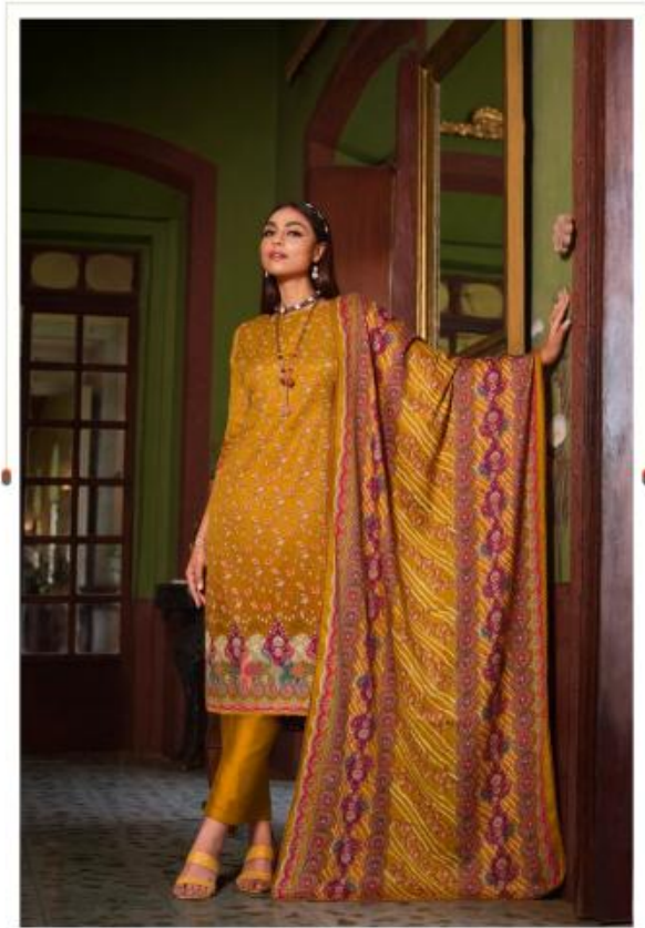
THE MAGNUM OPUS | 522-002

REPRODUCING THIS AND/OR ANY PART OF IT WITHOUT THE WRITTEN PERMISSION OF THE PUBLISHER IS STRICTLY PROHIBITED. THE PUBLISHER ACCEPTS NO LIABILITY FOR ANY DAMAGE OR LOSS OF PROFITS OR REVENUE OR ANY OTHER DAMAGES OR LOSSES OF ANY KIND, INCLUDING THE GENERAL AND SPECIAL DAMAGES, DIRECT OR INDIRECT, CAUSED BY OR ARISING OUT OF THE USE OF THE INFORMATION CONTAINED HEREIN.