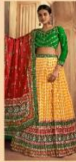
*** 2108 ***