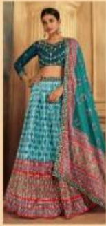
*** 2104 ***