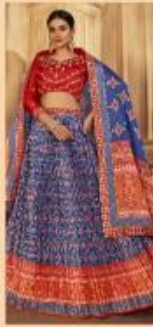
*** 2103 ***