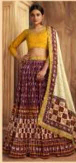
*** 2105 ***