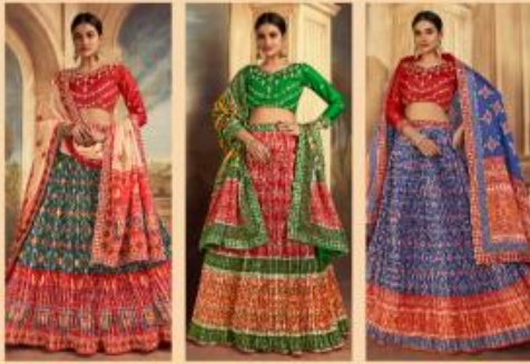
*** 2101 ***