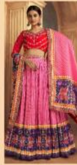
*** 2109 ***