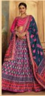
*** 2106 ***