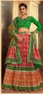
*** 2102 ***