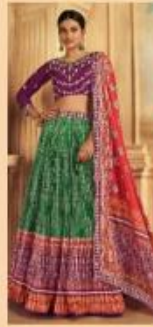
*** 2107 ***